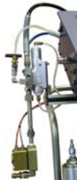
Automatic RTM ProGun